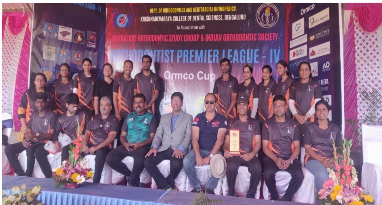
Participation in Orthodontic Premiere League