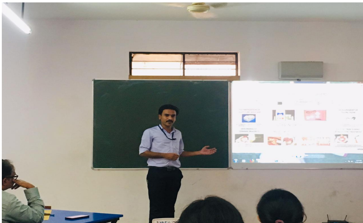
Scientific Poster Presentation