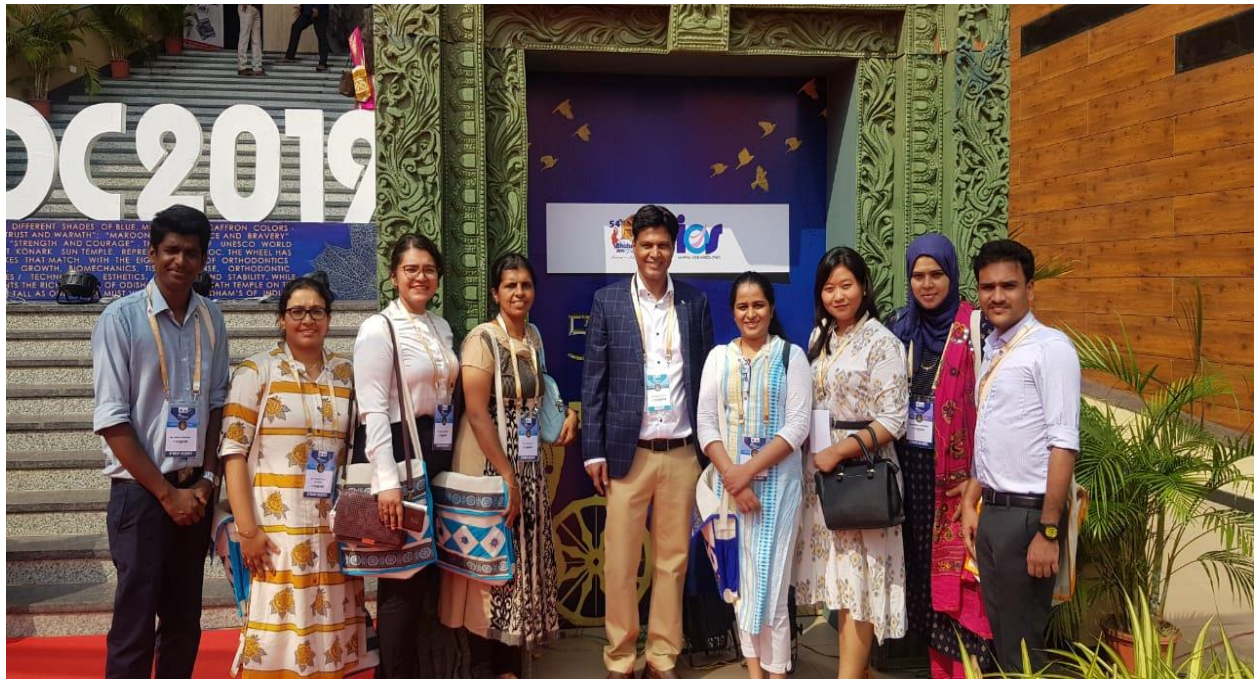
Bhubhaneshwar IOS Conference