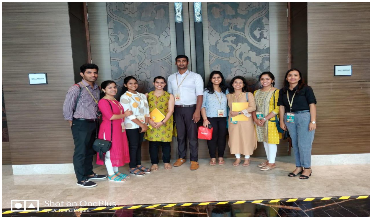
Oral Surgery Conference Bangalore